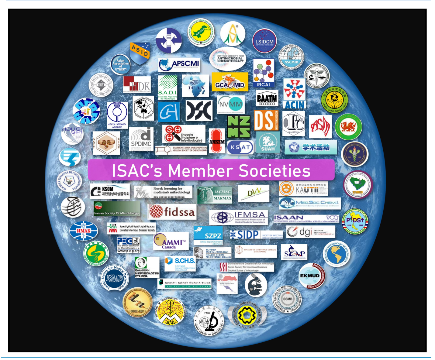
Geddes • ISAC / APUA Newsletter Vol 39. No 3 • © ISAC / APUA 2021

The full version of this article can be found in both ISAC's journals—International Journal of Antimicrobial Agents (IJAA) and Journal of Global Antimicrobial Resistance (JGAR)